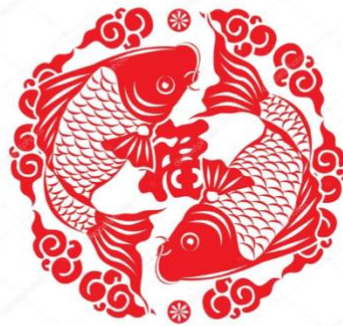
Chinese folk art Paper cut