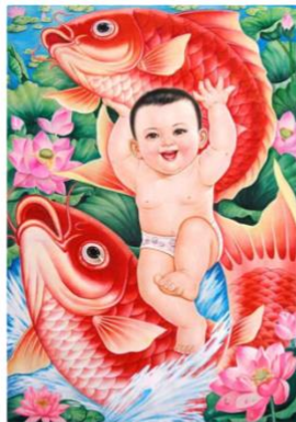
Vintage Chinese New Year Poster