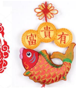
Typical Chinese New Year Decoration

This activity is for children to learn about the symbolic meaning of fish in Chinese culture and create their own lucky fish poster to celebrate the start of Chinese Lunar New Year.