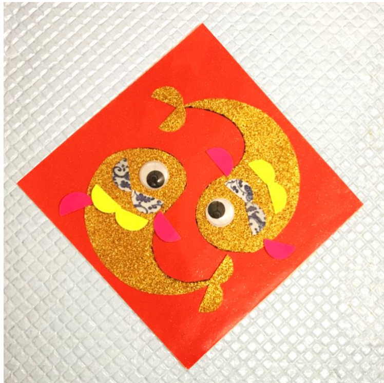
[Final look 完成品]