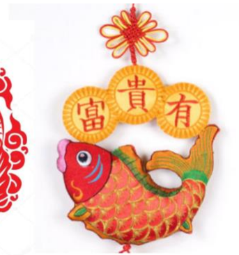
Typical Chinese New Year Decoration

This activity is for children to learn about the symbolic meaning of fish in Chinese culture and create their own lucky fish poster to celebrate the start of Chinese Lunar New Year.