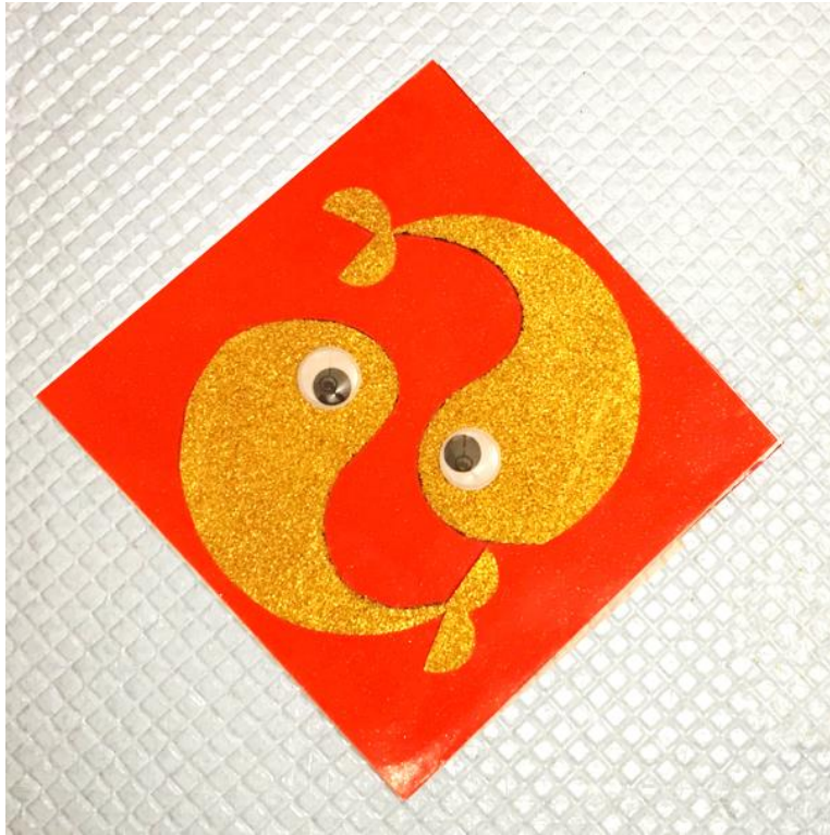
[Two fish can't wait to play 躍然紙上]