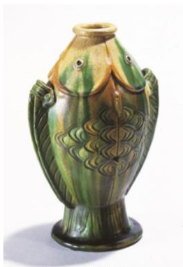
Sancai Fish Vase China 7th-8th Century

在中文裡，“魚”同“餘”字諧音，自古有著“盈餘”的吉祥象徵意義。在迎接春節之際，人們嚮往開年好運，因此魚的圖樣廣泛出現在春節裝飾物上。