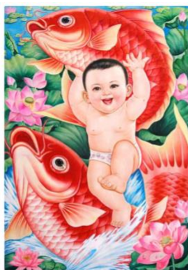
Vintage Chinese New Year Poster