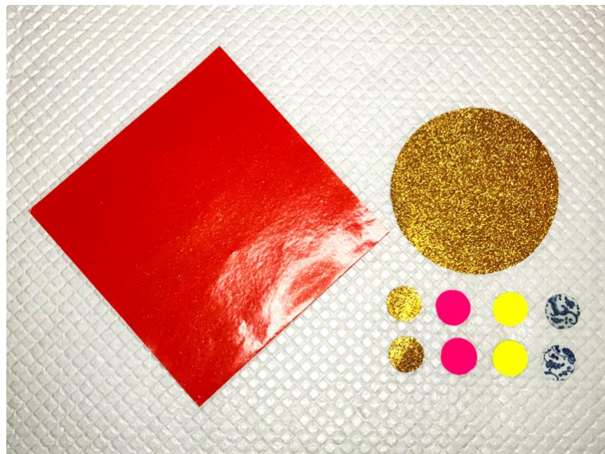
[Basic shapes are done! 如圖即可]