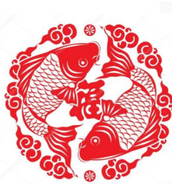
Chinese folk art Paper cut