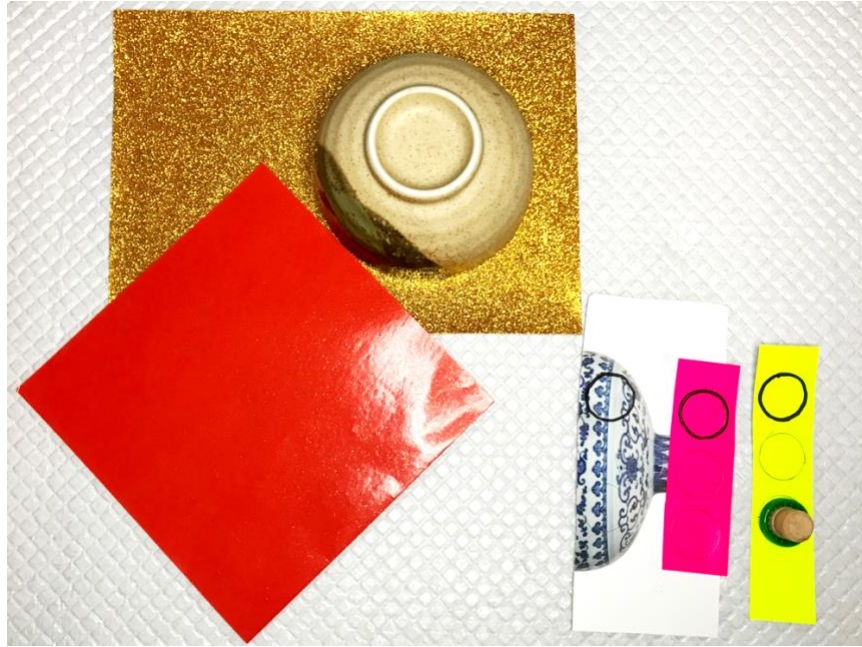
[Use the cap and bowl to draw circles 借助碗和瓶蓋畫出圓形]