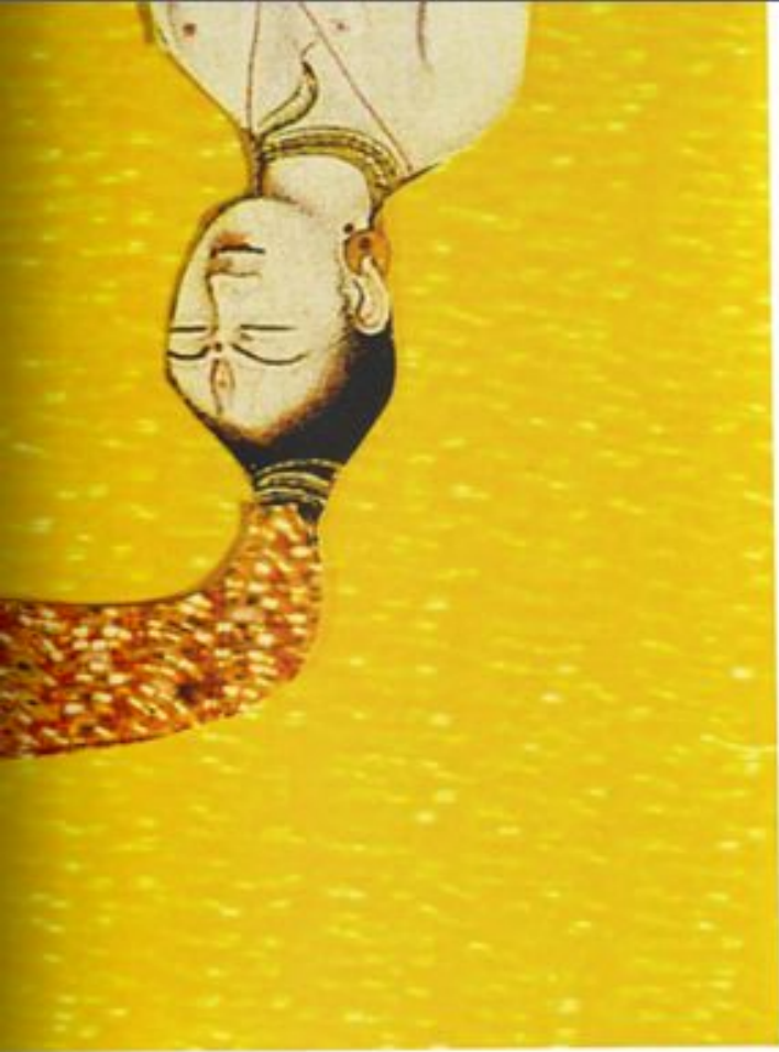
Yellow Brick Road Meera Chauda 2015. Photographic Collage.