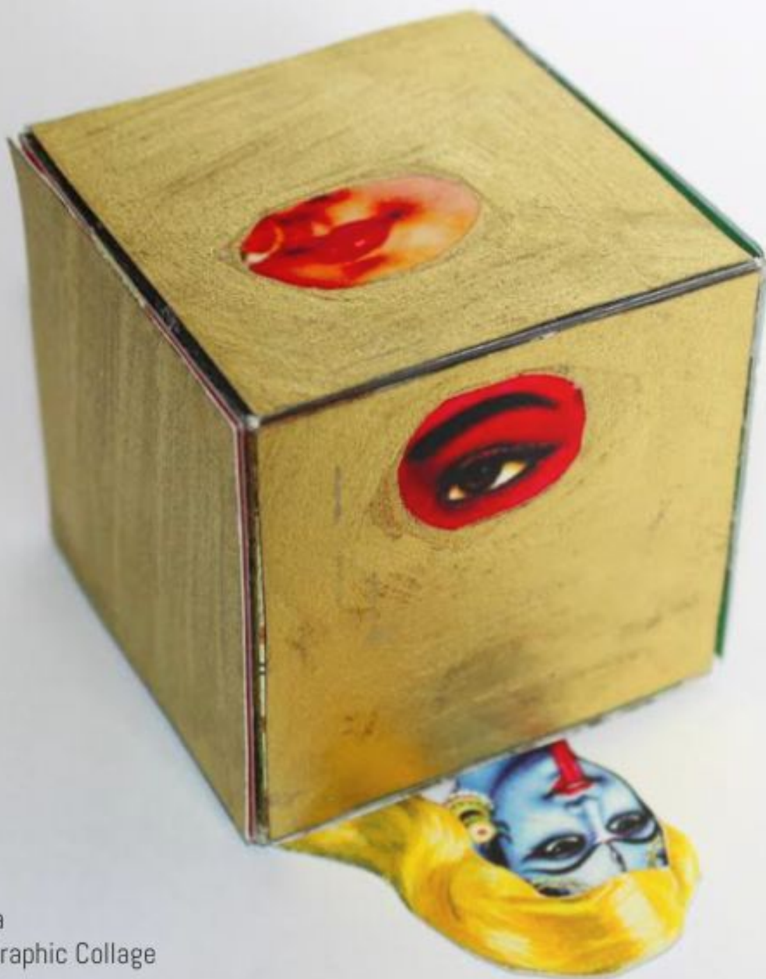
Drop 1 Meera Chauda 2017. Photographic Collage