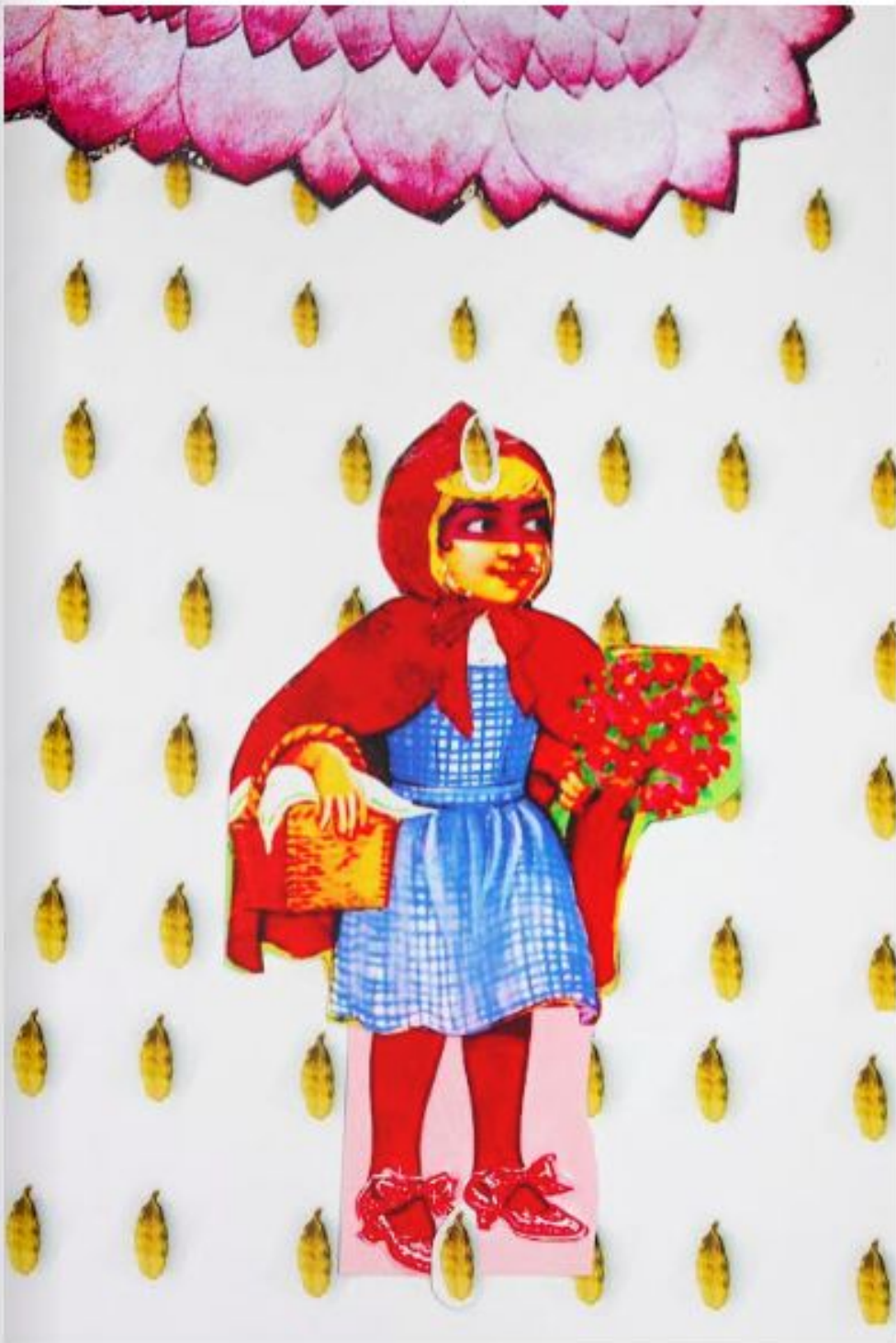
Cardamom Rain Meera Chauda 2020. Photographic Collage